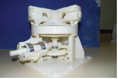
A working model.

Before adopting 3D printing, Premium's R&D department made