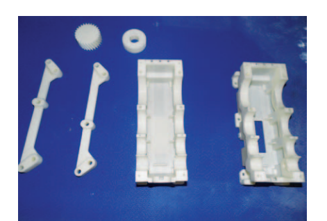
3D printing has eliminated design constraints.

Premium invested in a 3D printer based on FDM<sup>®</sup> technology to produce prototypes for its entire range of products and components in house.